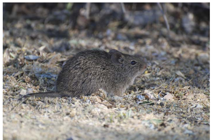
Fig. 1. —An adult male Sigmodon arizonae from Sweetwater Wetlands, Pima County, Arizona.