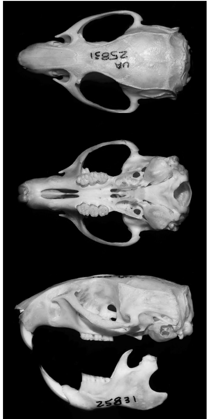
Fig. 2. —Dorsal, ventral, and lateral views of skull and lateral view of mandible of an adult male Sigmodon arizonae (University of Arizona School of Ecology and Evolutionary Biology mammal collection [UAEEB]) from Arizona, Cochise County, 1.8 km east, 2.3 km north of Hereford–Paluminas Road, elevation 1,261 m. Occipitonasal length is 1.5 cm.

Means (ranges in parentheses) of external measurements (mm) of adult S. arizonae were: total length, 305.5 (247.0–363.0; n = 154 ); length of tail, 124.4 (101.0–145.0; n = 154 ); length of hind foot, 38.5 (34.0–43.0; n = 158 ); length of ear, 20.4 (18–24; n = 127 —Carleton et al. 1999; Hoffmeister 1986). Mean (range) mass (g) of 19 adult S. arizonae was 150.3 (83.0–300.0—Carleton et al. 1999). Means (range) of cranial measurements (mm) for adult S. arizonae were: occipitonasal length, 35.2 (27.4–40.4; n = 160 ); zygomatic breadth, 20.9 (17.4–23.8; n = 164 ); interorbital breadth, 5.1 (4.5–5.6; n = 164 ); breadth of braincase, 14.9 (13.9–16.3; n = 160 ); breadth of occipital condyles, 8.1 (6.9–8.8; n = 20 ); depth of braincase, 11.7 (9.9–12.9; n = 19 ); distance between