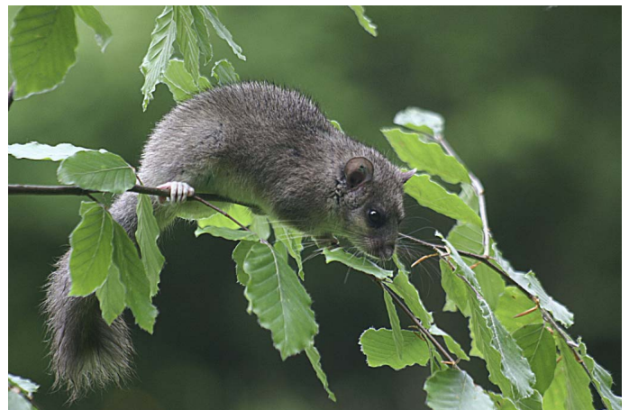
Fig. 1.—Adult Glis glis from Mt. Kočevski Rog, Slovenia.

Glis italicus Barrett-Hamilton, 1898:424. Type locality “Siena,” Italy.