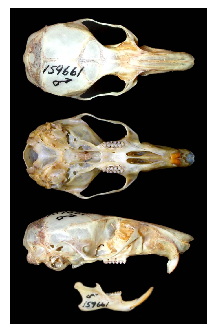
Fig. 2. —Dorsal, ventral, and lateral views of skull and lateral view of mandible of an adult male Peromyscus mexicanus (159,661; Museum of Vertebrate Zoology); from 8.8 miles SE (by road) Catemaco. Greatest length of skull is 32.88 mm.