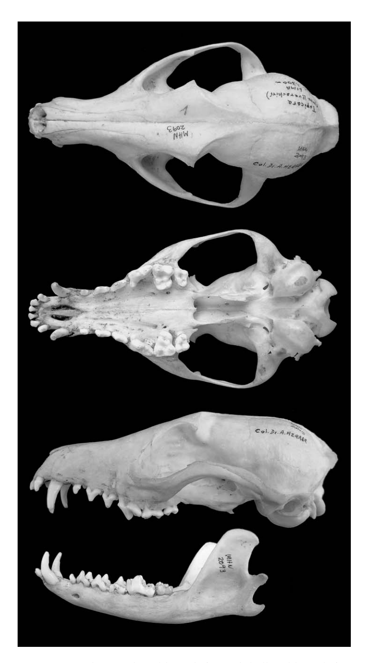
Fig. 2. —Dorsal, ventral, and lateral views of skull and lateral view of mandible of an adult male Lycalopex sechurae (MUSM [Museo de Historia Natural de la Universidad de San Marcos] 2093) from Huarochirí, Lima, Peru. Condylobasal length is 119.4 mm.

General color of pelage is grayish, with pale underfur and agouti guard hairs, whereas the underparts are white, fawn, or cream-colored. The face is gray with a narrow rufous-brown ring around the eyes, dark muzzle, and white upper lip and chin (Thomas 1900). Backs of ears are rufous. The throat and chest are white with a gray band or collar across the chest. The front limbs (up to the elbows) and the back limbs (up to the heels) are usually reddish. The tail of