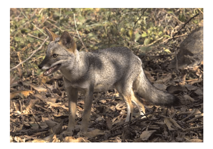
Fig. 1.—An adult male Lycalopex sechurae from Lambayeque, Peru, 2007.

Lycalopex comes from the Greek lycos for wolf and alopex for fox. The specific epithet, sechurae, is a Latinized