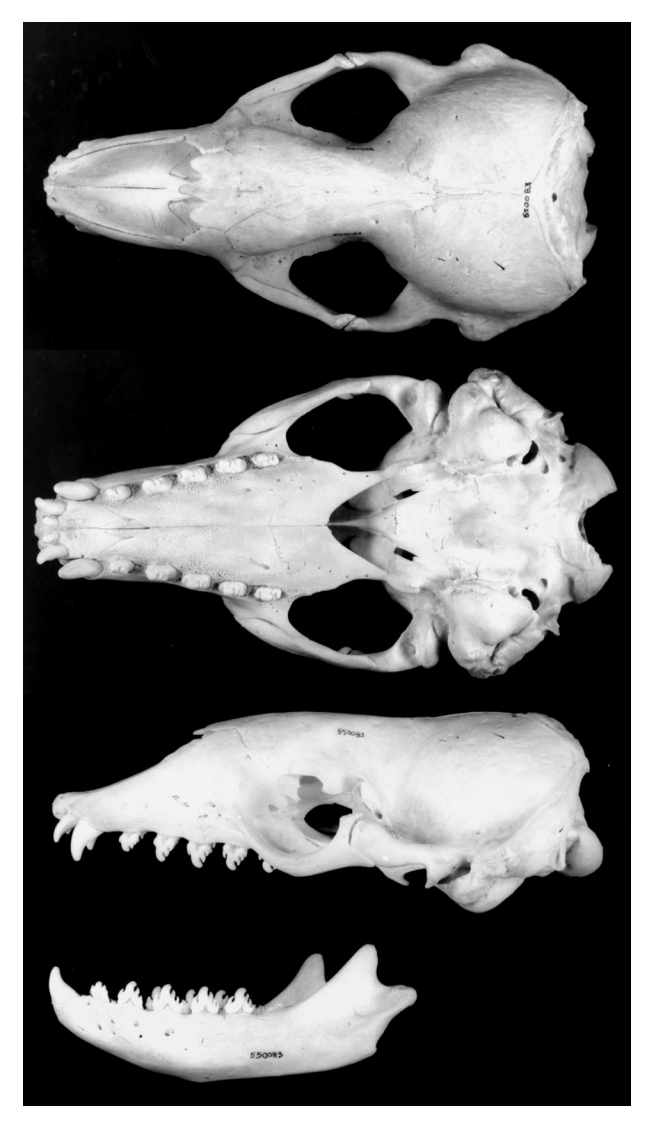
FIG. 2. Dorsal, ventral, and lateral view of skull and lateral view of mandible of an adult male Lobodon carcinophaga collected 14 February 1970 from Seymour Island, Antarctic Peninsula, Antarctica (National Museum of Natural History, USNM 550083). Condylobasal length is 288.1 mm.

postcanine toothrow, 7.9 \pm 0.3 (n = 8—Barrett-Hamilton 1901; Bryden and Erickson 1976; Bryden and Felts 1974; Cruwys and Friday 1995; Laws et al. 2003b; Le Souef 1929; Scolaro 1976; Wilson 1907). Nonstandard measurements are available (Bruce 1913; Krylov 1972; Krylov and Popov 1980).