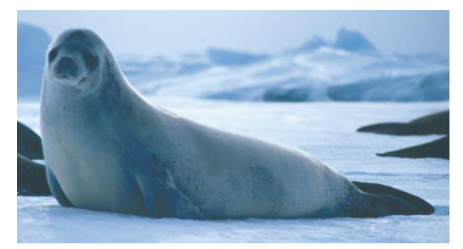
FIG. 1. A crabeater seal ( Lobodon carcinophaga ) of unknown sex.