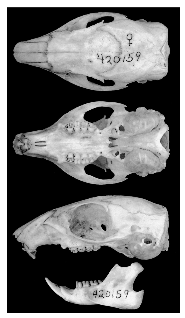
FIG. 2. Dorsal, ventral, and lateral views of cranium and lateral view of mandible of Xerus erythropus from Pirisi, Ghana (female, National Museum of Natural History, USNM 420159). Greatest length of cranium is 59.5 mm.

Mammae are nearly evenly spaced with the 1st pair just below the rib cage, the 3rd pair in the groin area, and the 2nd pair approximately equidistant between the 1st and 3rd (Rosevear 1969; R. Thorington, pers. comm.).