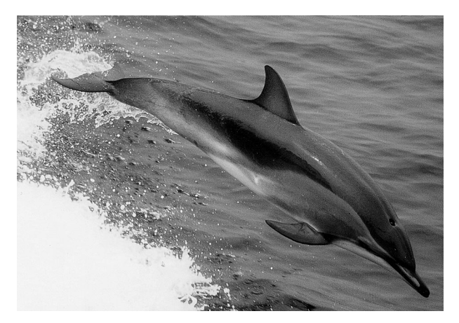
FIG. 1. A Clymene dolphin in the northern Gulf of Mexico.

ONTOGENY AND REPRODUCTION. Information on reproductive status is available for 7 females and 12 males, all from the southeastern United States and Gulf of Mexico (Jefferson et al. 1995; Perrin et al. 1981; Schmidly and Shane 1978). The smallest sexually mature female was 171 cm in length, and the smallest adult male was 175 cm; a female measuring 168 cm was considered