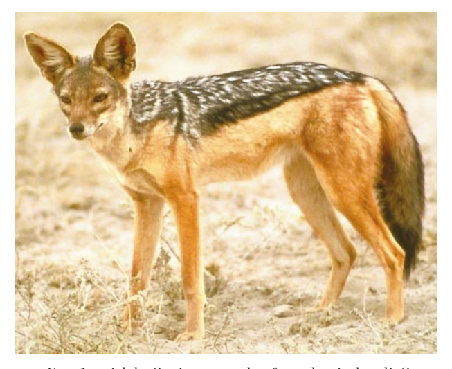
FIG. 1. Adult Canis mesomelas from the Amboseli Game Reserve, Kenya.