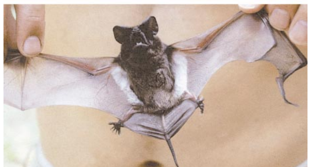
Fig. 1. Photographs of Chaerephon nigeriae , lateral view of adult from Sengwa, northwestern Zimbabwe and ventral view of adult female from Zimbabwe.