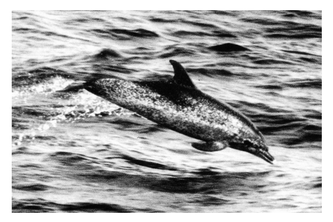
FIG. 1. Adult Stenella frontalis .

The Atlantic spotted dolphin varies geographically in size and degree of spotting (Perrin et al. 1987). In some areas, such as the east coast of the United States and the coast of West Africa, some individuals are so heavily spotted as to appear almost white at a distance, with nearly all the details of the underlying basic pattern obscured. In other areas, for example, north of Cape Hatteras on the east coast of the United States and far offshore in the pelagic western North Atlantic, adults are relatively small and may bear only a very few small and dark ventral spots, usually in the gular region. Some specimens from the Azores have fairly well-developed dorsal spotting but few or no ventral spots. The largest body size is exhibited by animals inhabiting the continental shelf of North America (U.S. east coast, Gulf of Mexico, and Central America),