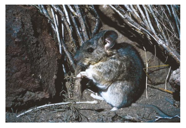
FIG. 1. Photograph of Neotoma lepida . Photograph reprinted from Verts and Carraway (1998) with permission of the photographer, Ronn Altig.

GENERAL CHARACTERS. Dorsal pelages among desert woodrats range from pale, buffy gray to dark gray and from cinnamon to nearly black. Depending on the color of substrate, considerable variation in pelage color may occur within an area of