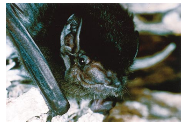
FIG. 1. Gould's wattled bat, Chalinolobus gouldii , from Picola, Victoria, Australia.