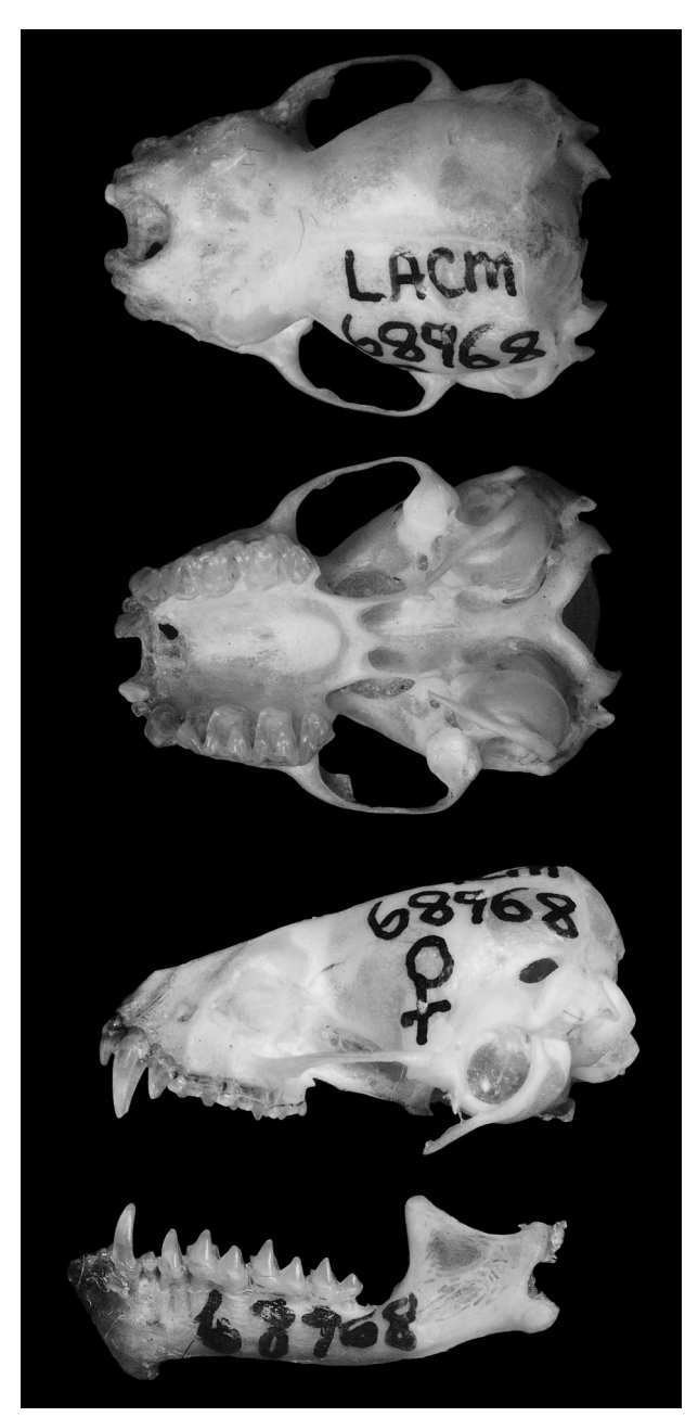
FIG. 2. Dorsal, ventral, and lateral views of cranium and lateral view of mandible of an adult female Chalinolobus gouldii ([Queensland Museum] JM-6328, collected 1 October 1981, 42 km SSW of Cloncurry, Queensland, Tap Camp Diggings; formerly in Los Angeles County Museum). Greatest length of skull is 14.8 mm.

for the same characters for bats from northern Australia are: length of head and body (mm), 52.4 (46.0–60.4; n = 30); length of tail (mm), 40.1 (31.0–46.0; n = 28); length of forearm (mm), 41.2 (36.6–45.9; n = 106); and mass (g), 9.8 (6.8–15.8; n = 98—Churchill 1998). Wingspan for 28 bats from northern Australia was 295 mm (273–330—Churchill 1998).