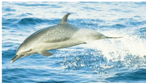
FIG. 1. Gray's pantropical spotted dolphin ( Stenella attenuata attenuata ) from the eastern tropical Pacific.

Eye stripe encloses a black eye spot and extensions of the eye spot as a black line (a few mm wide) occur forward to apex of melon (Perrin 1997). The entire eye stripe may be bordered by a narrow light line. Blowhole stripe is relatively narrow and may be composed of subelements. Intersection of anterior end of flipper stripe and lip mark is demarcated by a narrow light line. Ventral margin of flipper stripe may be bordered by a narrow light line and subtended by a parallel narrow dark line. A light-gray band (4–6 cm) may parallel the ventral margin of the cape. In heavily spotted individuals of the eastern Pacific coastal subspecies, the ground pattern may be nearly obscured dorsally. Spotting may extend to