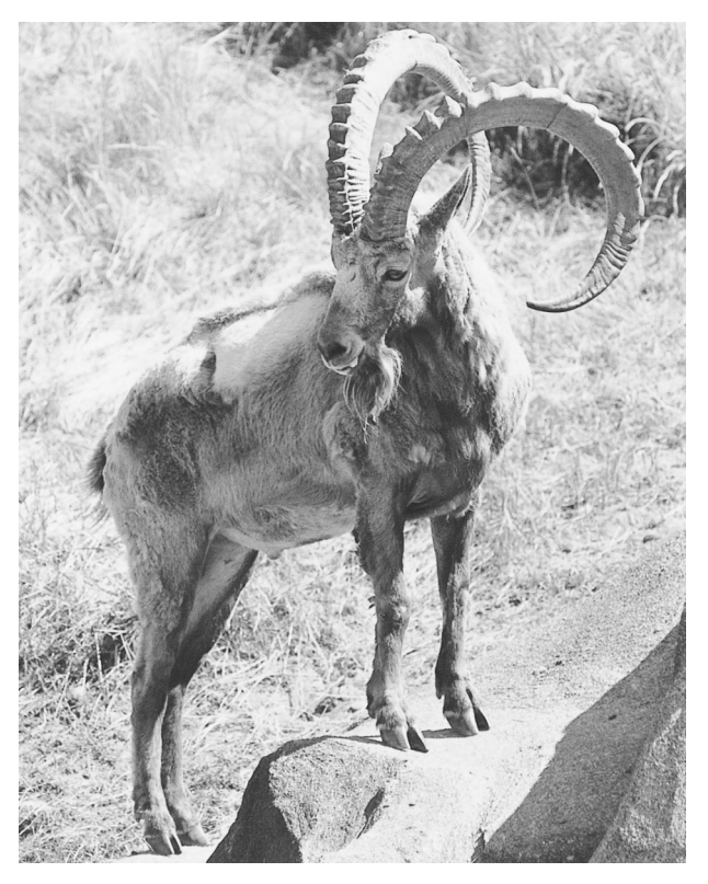
FIG. 1. Adult male Capra sibirica at San Diego Zoo.

DIAGNOSIS. Capra sibirica (Fig. 1) is the largest and heaviest-built species in the genus. Total length of adult males reaches 171 cm, height at withers is 110 cm, and body mass is 130 kg, compared with 170 cm, 115 cm, and 109 kg in C. falconeri and 165 cm, 109 cm, and 96 kg in C. caucasica. C. ibex and C. aegagrus are considerably smaller: 150 cm, 93 cm, 65–117 kg and 150 cm, 95 cm, and 70–80 kg, respectively (Heptner et al. 1961; Schaller 1977). Skull (Fig. 2) of C. sibirica is similar to that of C. aegagrus but differs from other Capra by having longer nasals. Compared to C. aegagrus , forehead of C. sibirica is broader and less bulging: width between eyes is longer than length between front edge of choana and lower edge of occipital foramen (basion) and covers 53% of total length of skull. Length of maxillary premolars