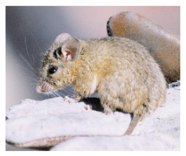
FIG. 1. Specimen of Peromyscus dickeyi endemic to Isla Tortuga.

DISTRIBUTION. Peromyscus dickeyi known only from Isla Tortuga, Gulf of California (Fig. 3), México (Avise et al. 1974; Burt 1932; Hall 1981). No fossils of P. dickeyi are known.