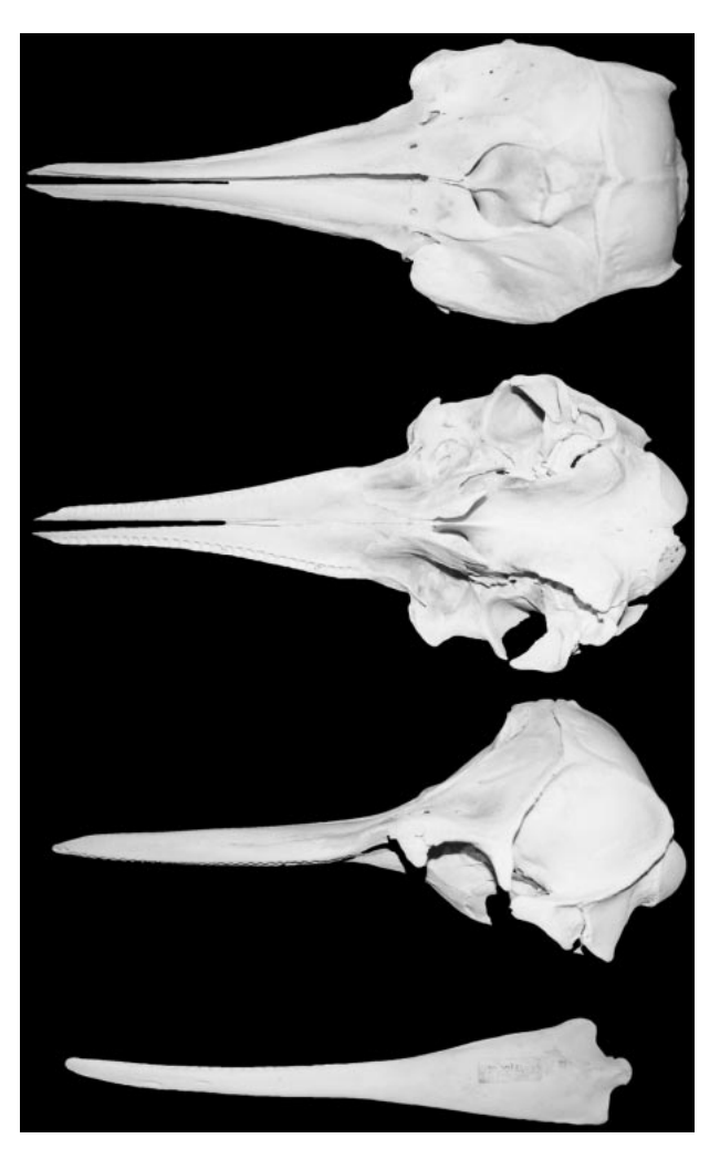
FIG. 2. Dorsal, ventral, and lateral views of cranium and lateral view of mandible of an adult Sousa chinensis (female) from Hong Kong (OPCF SC97-31/05-B). Greatest length of cranium is 507 mm.

GENERAL CHARACTERS. Indo-Pacific humpback dolphins are medium-sized dolphins, up to 2.8 m in length (Ross et al. 1994). Maximum weight is 250–280 kg (Jefferson 2000; Ross et al. 1994). In southern African waters, Indo-Pacific humpback dolphins are sexually dimorphic in length, with males (mean length = 226 cm, n = 29) larger than females (mean length = 216 cm, n = 10—Ross et al. 1994). In Hong Kong, significant sexual dimorphism is not evident (Jefferson 2000).