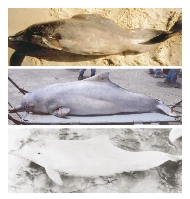
FIG. 1. External appearance of Sousa chinensis . Upper photo: from the Persian Gulf area, exhibiting darker coloration and exaggerated dorsal hump found in specimens from the western Indian Ocean. Lower 2 photos: from Hong Kong and Australia, showing light body color and absence of a dorsal hump, characteristic of animals from the eastern part of the range of the species.

Skull of Sousa chinensis is large, heavily built, and has a long, narrow rostrum, with concave margins (Fig. 2). Rostrum represents 57-67% of condylobasal length, which can reach at least 575 mm; Delphinus and Stenella are smaller (Ross et al. 1994). Distinctive features are very large and round temporal fossae (length 17-24% of condylobasal length), and separation of the pterygoids along base of rostrum (Ross et al. 1994). Mandibles of Sousa have concave margins, and mandibular symphysis is very long, ca. 21-28% of condylobasal length (Ross et al. 1994). These features distinguish Sousa from other genera in its range, except Steno. Skull of S. chinensis is easily confused with that of Steno bredanensis (roughtoothed dolphin), but the species can be distinguished by tooth counts (generally 30-38 in Sousa and 19-28 in Steno) and size of orbit (generally <13% of condylobasal length in Sousa and >13% of condylobasal length in Steno-Miyazaki and Perrin 1994; Ross et al. 1994). In addition, teeth of Steno have deep longitudinal ridges, whereas those of Sousa have only slight ridges, if any.