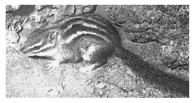
FIG. 1. Photograph of an adult Tamias minimus .

Pelage on sides, rump, and thighs ranges from Pinkish Buff or Light Pinkish Cinnamon through Clay or Sayal Brown to Ochraceous Tawny (color names follow Ridgway 1912). Venter is whitish. Dorsum is marked with 5 dark and 4 light longitudinal stripes that extend from nape to base of tail. The dark stripes range from Pink-