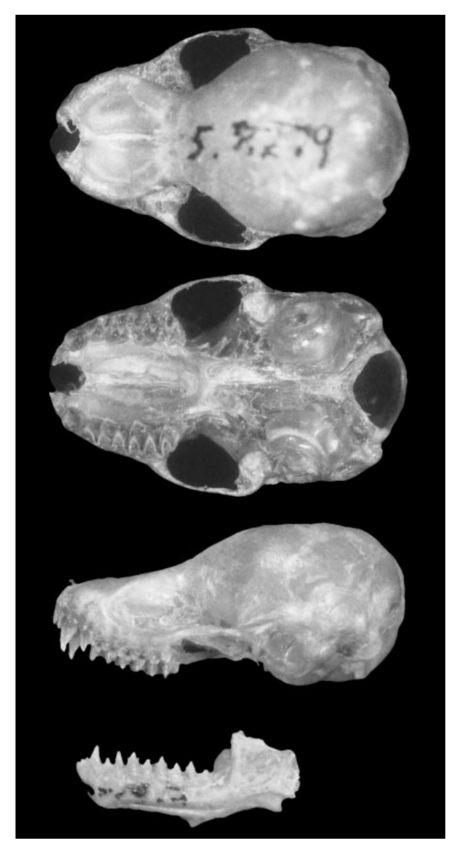
FIG. 2. Dorsal, ventral, and lateral views of the skull and lateral view of the mandible of Pipistrellus bodenheimeri from Ein Gedi, Israel (male, Harrison Zoological Museum 5.8279). Greatest length of skull is 10.0 mm.

pinna is extremely well developed, high, and narrow. Tragus is concave on its anterior border and rises to a blunt point at ca. half the height of the pinna. The superior border is slightly convex and meets the posterior border at the broadest point of the tragus, which is at ca. two-thirds of its total height (Harrison 1960).