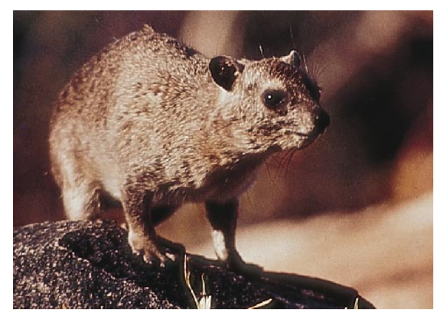
FIG. 1. An adult Heterohyrax brucei exhibiting vigilance. Photographed in northwestern Zimbabwe by Craig van der Heiden.