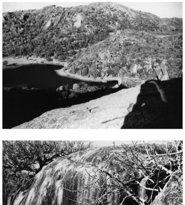
FIG. 4. Kopje habitat of Heterohyrax brucei .

and Smithers, 1990). Litter size varies geographically, averaging 1.6 in Tanzania (Hoeck, 1982 a ), 1.7 in Kenya (Sale, 1969), and 2.1 in Zimbabwe (Barry, 1994). Where H. brucei is syntopic with P. capensis , a significant proportion of nurseries may be heterospecific with calves of both species present (Barry, 1994; Hoeck, 1975, 1982 a ; Hoeck et al., 1982). Females suckle their young for <6 months, and young invariably suck from the same nipples, reducing competition (Hoeck, 1977 a ). Male offspring disperse usually between 12 and 30 months, after becoming adolescent (Hoeck, 1982 a ). One female reached an age of >11 years (Hoeck, 1989).