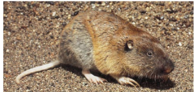
FIG. 1. Photograph of Thomomys mazama from Rochester, Washington.

Thomomys m. hesperus is dichromatic; most individuals are dark reddish brown, but some are black (Walker, 1949). Bailey (1915) speculated that the black subspecies in western Oregon, T. m. niger , was dichromatic, even though to that time only specimens of the black phase had been taken. Walker (1949) examined ca. 175 specimens from within the range of the latter race without finding other than black individuals; he further claimed that greenish iridescence in T. m. niger was lost in summer leaving a dull slaty-black pelage. Later Walker (1955) reported examining 23 specimens from Marys Peak (= Chintimini Mountain), Benton County, Oregon, 7 of which were black with most cranial characters referable to T. m. niger and 16 of which were brownish but with