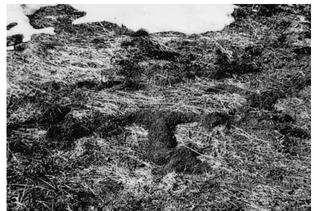
FIG. 5. Casts of Thomomys mazama burrows formed when snow that contained burrows packed with earth melted.

CONSERVATION STATUS. As of 28 October 1998, T. mazama was listed as a “candidate” species by the Washington Department of Fish and Wildlife and a “species of concern” by the U.S. Fish and Wildlife Service. The species was not included on lists of threatened or endangered species prepared by the Oregon