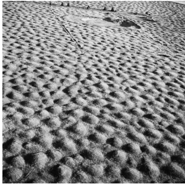
FIG. 4. Mima mounds at Mima Prairie, Washington. Gravel pit, roads, and buildings in distance provide scale reference for size of mounds.

Based on analysis of plant epidermal fragments, “Stomachs from 110 T. mazama contained 31 species of plants, or 67 percent of the plants occurring on the study area” (Burton and Black, 1978: