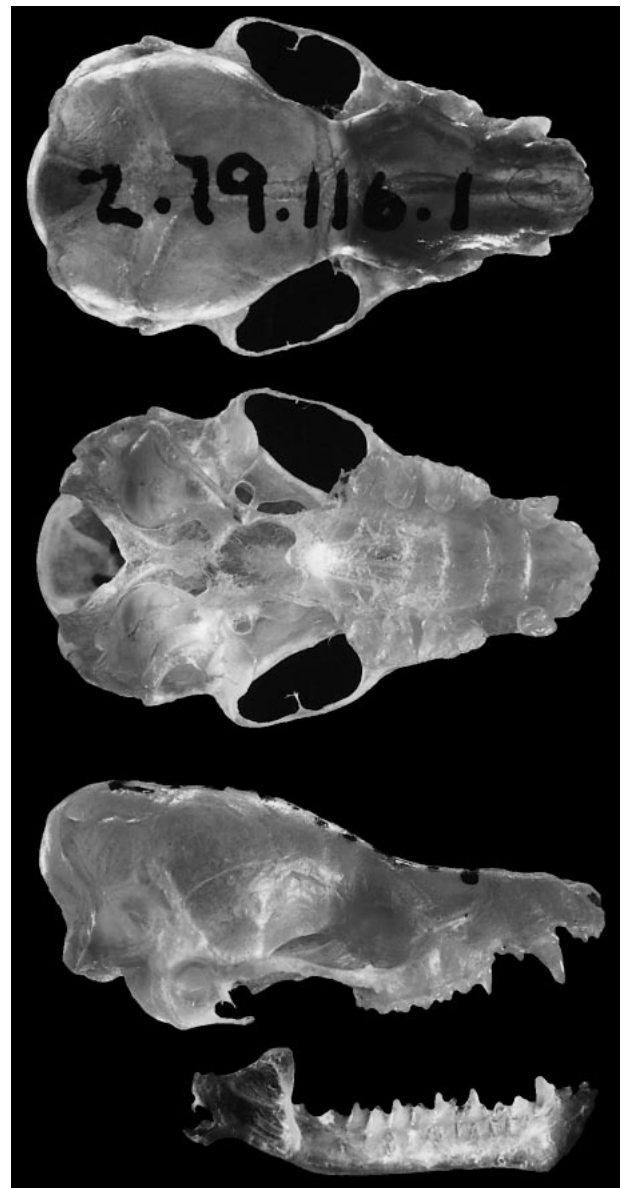
FIG. 2. Dorsal, ventral, and lateral view of the skull and lateral view of the mandible of a male Myotis septentrionalis (Provincial Museum of Alberta, Z79.116.1, from Cadomin, Alberta). Greatest length of skull 15.3 mm.

Body mass is 5–8 g. Mean (van Zyll de Jong, 1985) and range Glass and Ward, 1959; Turner, 1974) of some external and skull measurements (in mm) are as follows (Fig. 2): length of forearm, 36.4 (34–38); length of ear, 16.4 (14–19); total length, 86.2 (77–95); length of tail, 37.7 (35–42); length of hind foot, 9.4 (8–10); greatest length of skull, 14.8 (14.6–15.6); mastoid breadth, 7.8 (7.4–7.9); length of maxillary tooththrow, 5.8 (5.4–6.0); least interorbital width, 3.7 (3.4–3.8); and zygomatic breadth, 8.2–9.7. Other mean cranial measurements (in mm) include cranial depth, 5.0