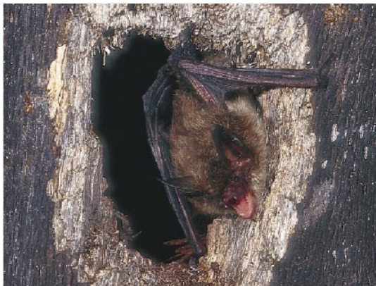
FIG. 1. Myotis septentrionalis at a roost hole.

GENERAL CHARACTERISTICS. Head and body length <50 mm, with total length up to 95 mm. Hind foot is generally <60\% length of tibia. Pelage and membranes are light brown; membranes usually concolor with pelage. Ears are long and usually extend past the nose when pushed forward. Third, fourth, and fifth metacarpals are of about equal length. Skull is narrow with a relatively long rostrum. Females are generally larger and heavier than males (Caire et al., 1979; Williams and Findley, 1979).