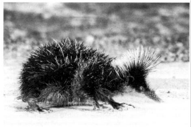
FIG. 1. Photograph of captive H. s. semispinosus at National Zoological Park (JFE).

The skull is elongated (Fig. 3), tapering anteriorly, and lacks a prominent sagittal crest. The dental formula is i\ 3/3, c\ 1/1, p\ 3/3, m\ 3/3 , total 40. Teeth show a reduction in size compared to other genera of Tenrecidae (Eisenberg and Gould, 1970; Mivart, 1871). There are 20-21 lumbar vertebrae and the pubic symphysis is widely open in some individuals, presumably females (Mivart,