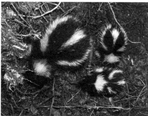
FIG. 2. Photograph of wild H. s. nigriceps in Madagascar (JFE).

1871). The urogenital and excretory systems exit the body through a common cloaca (Gould and Eisenberg, 1966).